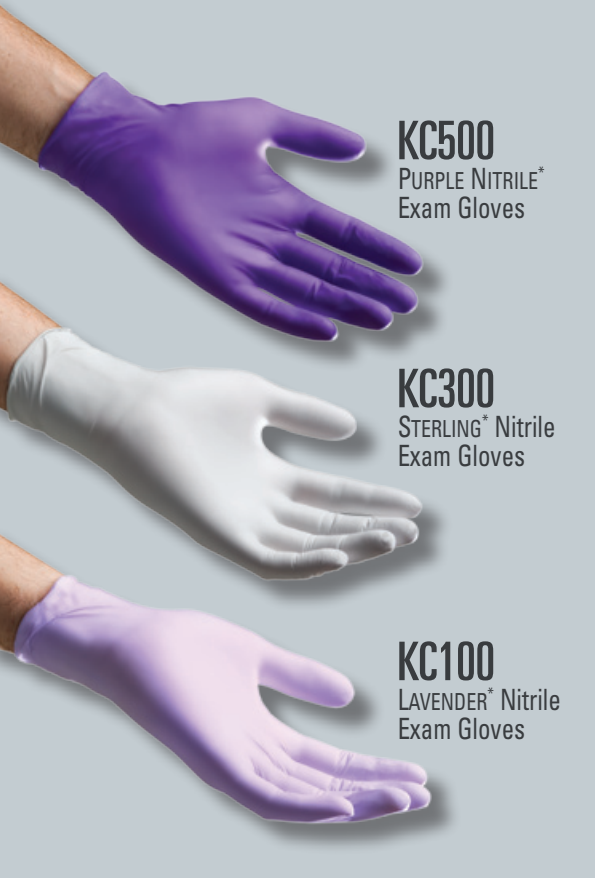
KC500 PURPLE NITRILE* Exam Gloves

STERLING* Nitrile Exam Gloves were specifically designed to fit and feel like latex, with excellent comfort and tactile sensitivity. They provide durable barrier protection in situations where expected fluid exposure is low to high. These gloves are available in 9.5 and 12-inch lengths, for maximum coverage and protection. Most STERLING* Nitrile Exam Gloves are cleared for use in chemotherapy. If you want to standardize on one exam glove that can fit virtually all your needs facility-wide, STERLING* Nitrile is the glove to choose.