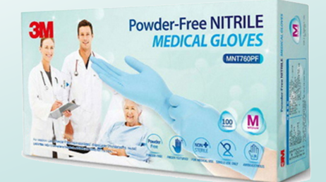
Weight : 4.4g±2%